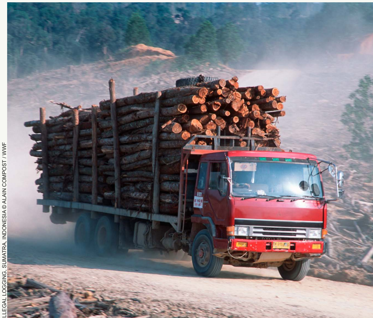
ILLEGAL LOGGING, SUMATRA, INDONESIA

The survey included questions on the legal requirements of the EUTR such as the duty of Member States to provide effective, proportionate and dissuasive penalties as described in Article 19. The survey also included questions related to points mentioned in the EUTR guidance document but which are not a direct legal requirements of the EUTR, alongside questions regarding best practices in CAs' enforcement of the EUTR (e.g. use of scientific methods to determine the illegality of products, registration of operators). This report summarizes the findings of the assessments in the 16 Member States and formulates recommendations for a better and more harmonized enforcement of the EUTR across Member States.